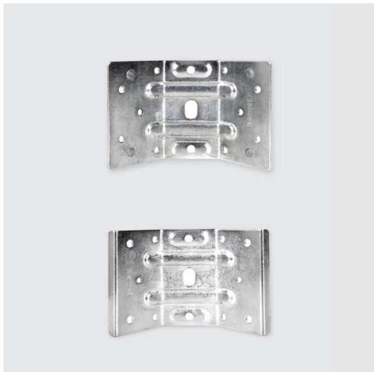
Table Corner Braces